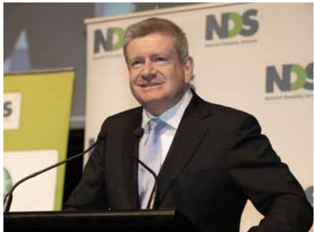
Senator Mitch Fifield – Shadow Minister for Disabilities – speaking at the Preparing for the New World Conference, Adelaide, May 2012

Across all its offices, NDS employs around 100 staff to implement its strategic directions and priorities and to manage its projects. Their considerable commitment, initiative and skill are an enormous asset to NDS.