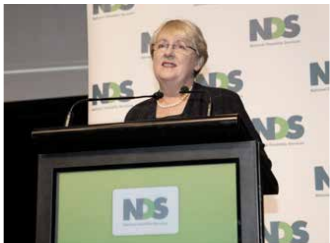
The Hon Jenny Macklin – Minister for Families, Housing, Community Services and Indigenous Affairs and Minister for Disability Reform – speaking at the Preparing for the New World Conference, Adelaide, May 2012